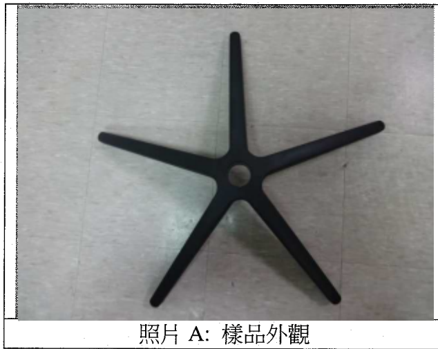
照片 A: 樣品外觀